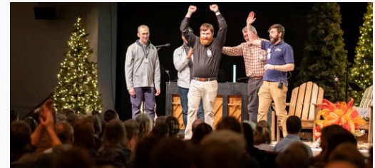
LLBC 90 th Reunion

Last, but not least, I was able to go to Guatemala again at the end of March for a week. It was my 3 rd year in a row attending this mission trip with my church, and each year I am so blessed to experience what God is doing. I am so grateful for the opportunity I have to serve in ministry locally, and abroad once a year as it gives a unique perspective that grows my passion for missions each year.