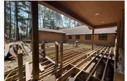
Dining Hall Deck Project