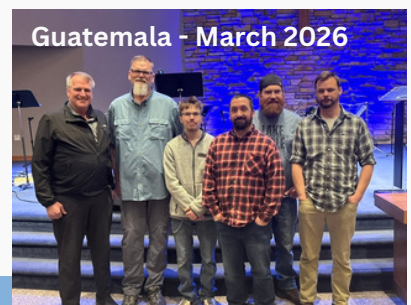
Guatemala - March 2026