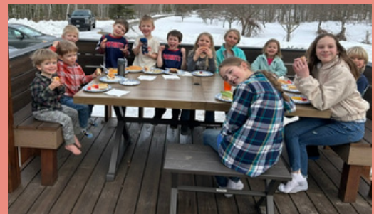
Gospel Community Group kids - picnic in the snow!