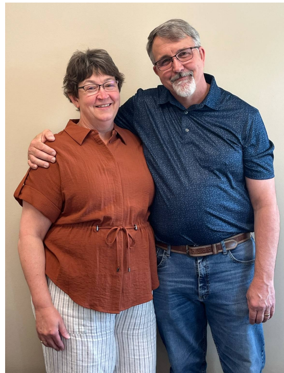
25 years later!