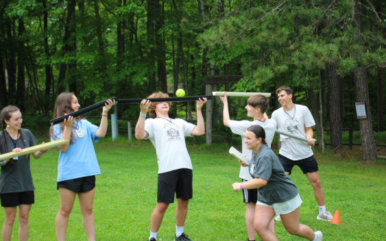
This activity is called the Gum Ball Factory