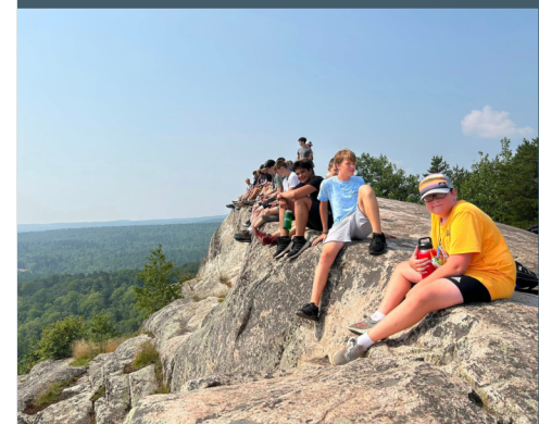
At the top of the mountain with discipleship campers