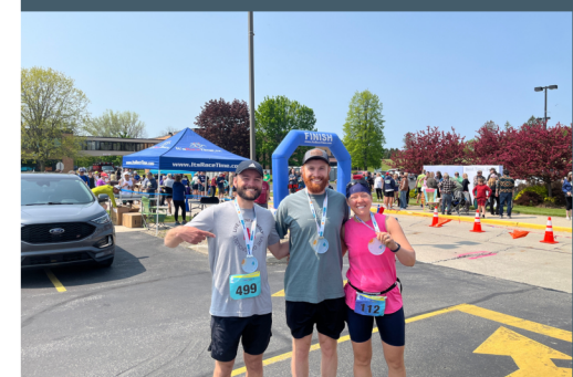
First official half marathon