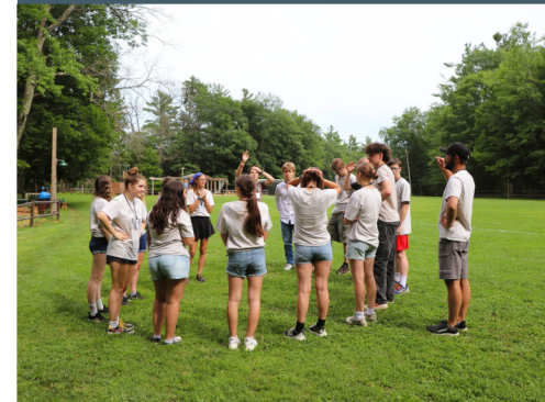
Team building time