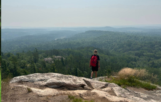
A discipleship camper in awe of God's creation