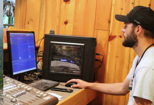
Behind the scenes