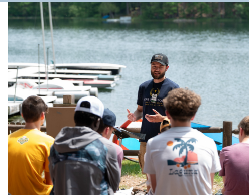
Teaching from the Word

My summer has been busy and good. A big part of it was filled with leading discipleship camps. I am always encouraged by these campers because they love Jesus and they desire to grow. I truly believe that some of the young people who come to our discipleship camps are going to do monumentally huge things for God's kingdom with their lives. It's a blessing to have the opportunity to build a solid gospel foundation in their lives, now, in their formative years.