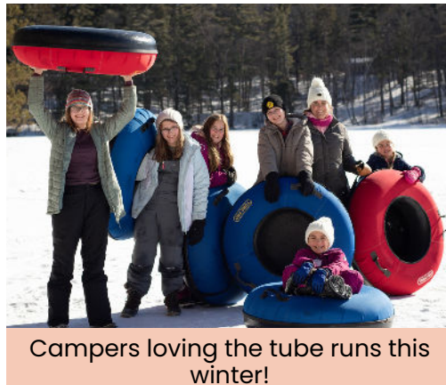
Campers loving the tube runs this winter!