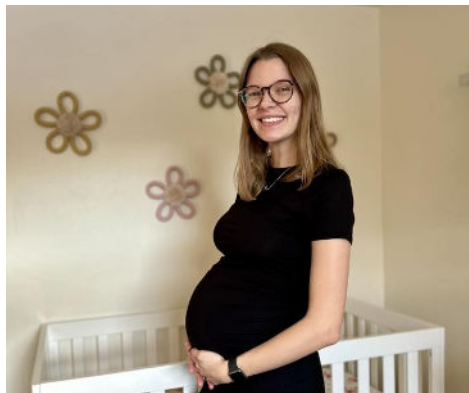
Spending many hours getting our daughter's nursery set up!