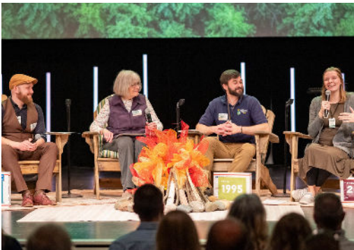
Sharing about the different eras at LLBC during the 90 th reunion

"This weekend really opened my eyes to everything and helped me realize that I need God more than I know. Also, to trust him better and let him walk through me, to make me a better person, wife, mom, and friend. I know that he will guide me in the right direction." -Women's Retreat Guest