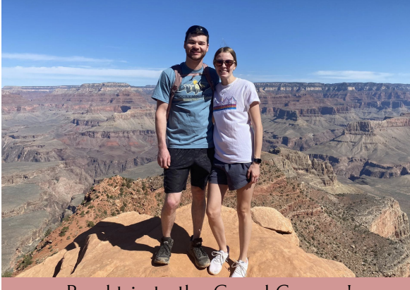
Road trip to the Grand Canyon!