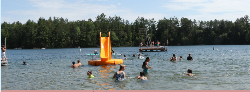
The lake very soon!