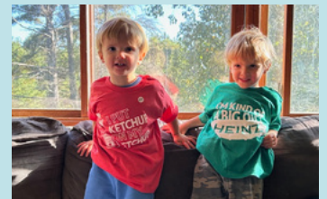
Twin Birthday Photo