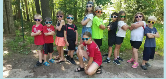
5 Day club with camp staff kids