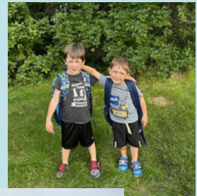
First day of School!