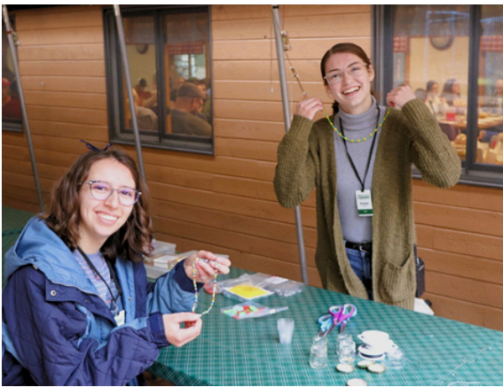
Necklace and bracelet making