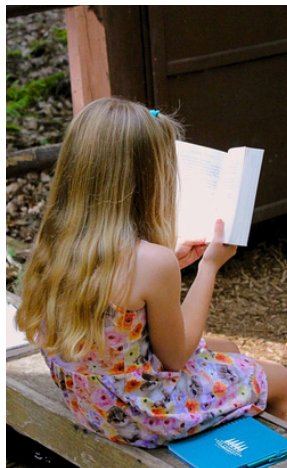
Mother daughter quiet time