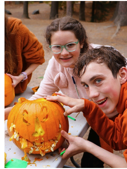
Pumpkin Carving Competition