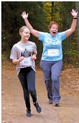
Spartan Racers nearing the finish line