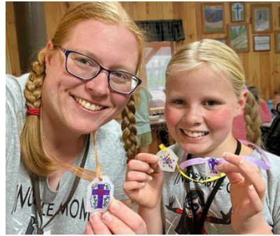
Mother Daughter Retreat crafts