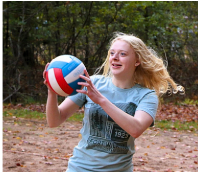
Nukem is always a hit