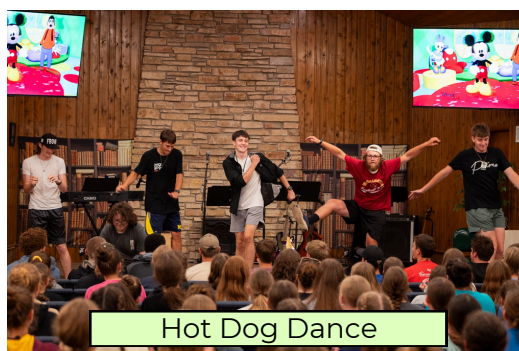
Hot Dog Dance