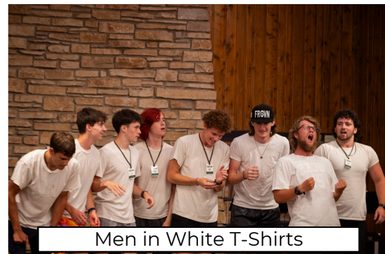
Men in White T-Shirts