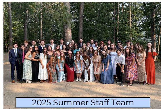
2025 Summer Staff Team

I am the Food Service Intern at LLBC. I serve primarily in the Kitchen, but also do other tasks to help around Camp. In my free time I enjoy sports, playing video games, hanging out with friends, and driving down backroads.