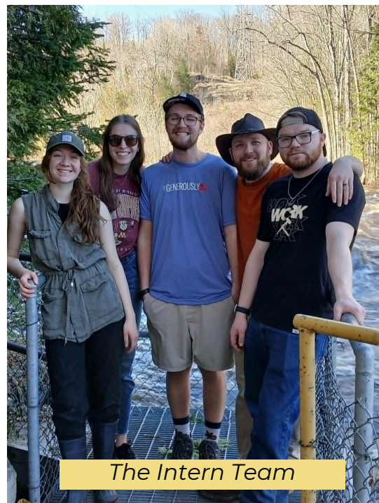
The Intern Team

I am the Food Service Intern at LLBC. I serve primarily in the Kitchen, but also do other tasks to help around Camp. In my free time I enjoy sports, playing video games, hanging out with friends, and driving down backroads.