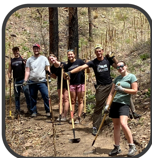
New Mexico Service Trip