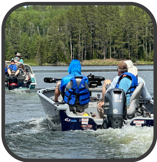
Canada Fishing Trip

Give online: visit llbc.org ; select "give"; select "donate now"; enter amount next to Jamie & Laura Strietzel; click "review your donation" Mail tax exempt gift to: Lake Lundgren Bible Camp, N18250 Lake Lane, Pembine, WI 54156