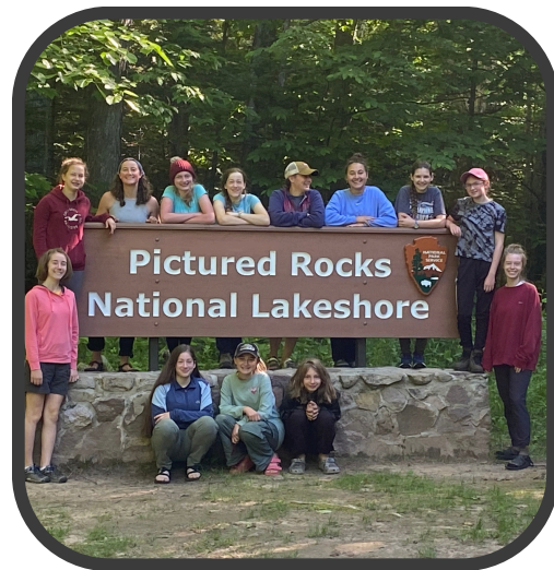
Jr. High Girls Backpacking Trip